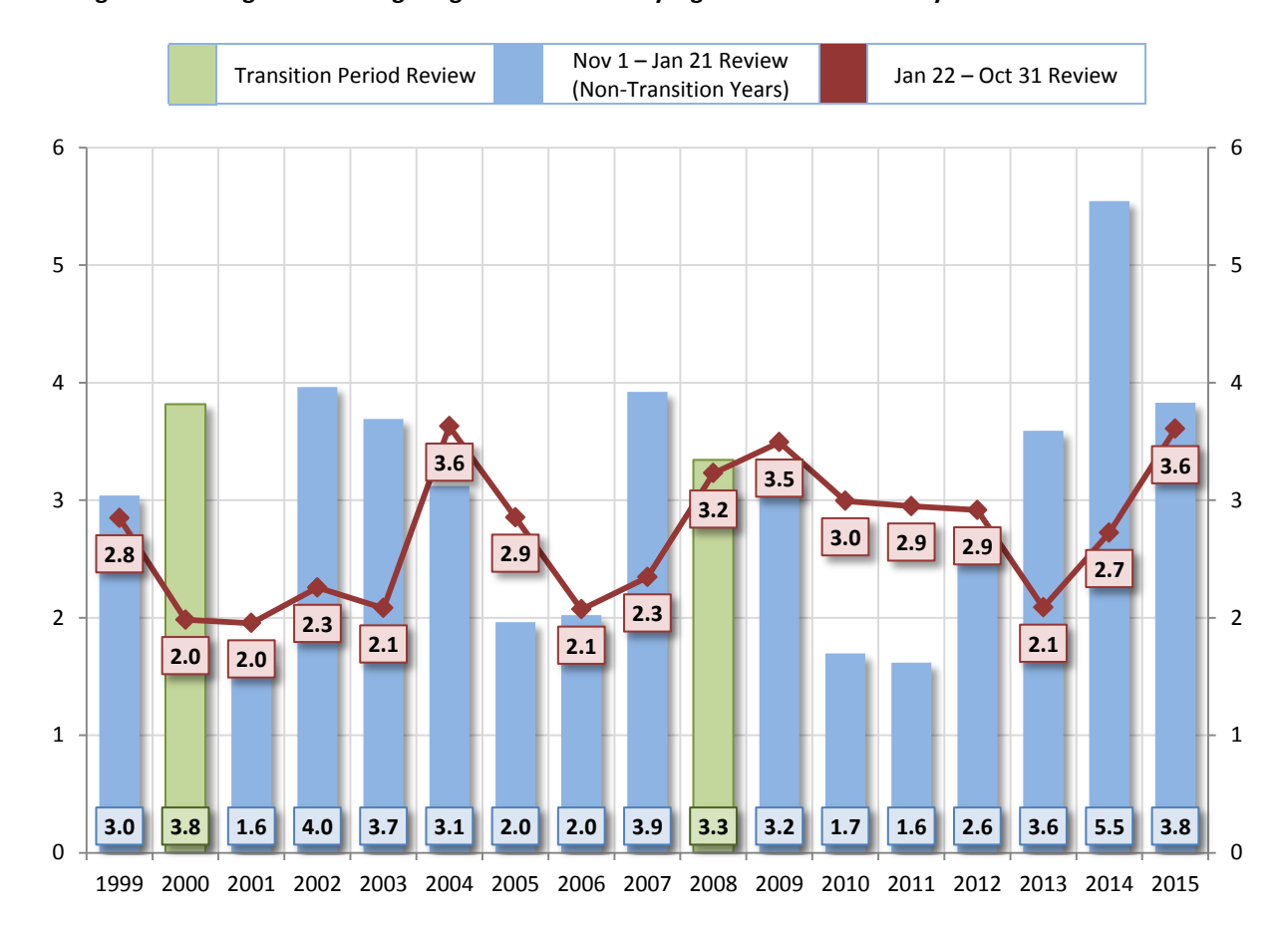
Figure 2: Average Rulemaking Length of Economically Significant Final Rules by Timeframe of OIRA Review

In 2008, Economically Significant final rules with completed OIRA reviews in the Transition Period had an average rulemaking length of 3.3 years – 3 percent longer than rules reviewed between January 22 and October 31 the same year (3.2 years). [Figure 2]