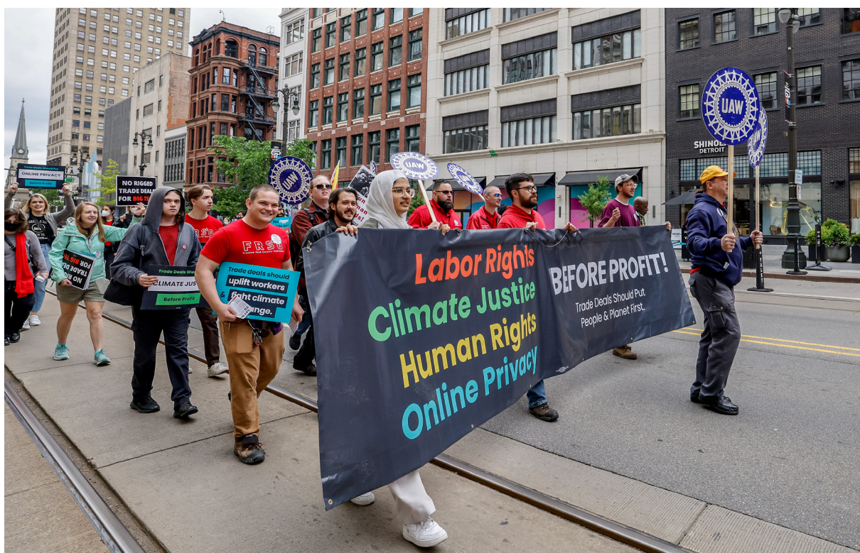
Outside a meeting of the Asia-Pacific Economic Cooperation in May 2023 in Detroit, local labor leaders, environmental advocates and economic justice activists call for the Indo-Pacific Economic Framework (IPEF) to include strong, enforceable labor and environmental terms and no special privileges for Big Tech.

The Biden administration's recognition of the need for a new trade model is encouraging, but the monumental task of actually creating that "worker-centered" policy has only just begun. While we conclude this year celebrating our accomplishments, we look forward to taking on the challenges and opportunities ahead. ■