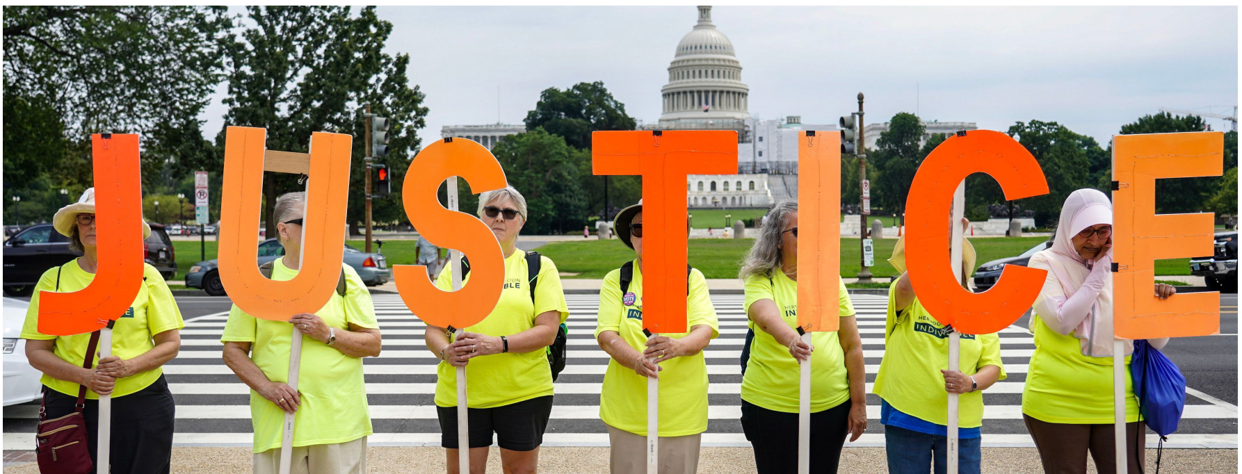
The Not Above the Law Coalition rallies for equal justice under the law before the arraignment for former President Donald Trump in Washington, D.C. in 2023.

The broader work to overturn Citizens United continues, and has included supporting efforts in the House to gain sponsors on H.J. Res. 13 – the Democracy for All Amendment – and the newly introduced companion resolution in the U.S. Senate. We are also working to support efforts to make Minnesota and Michigan the 23rd and 24th states to call for an amendment by working to pass resolutions in their state legislatures. Whether it was protecting election officials as the upcoming election approaches, working to regulate A.I., or calling for accountability for attempts to subvert elections, Public Citizen has helped lead the critical fights to safeguard democracy in 2023. ■