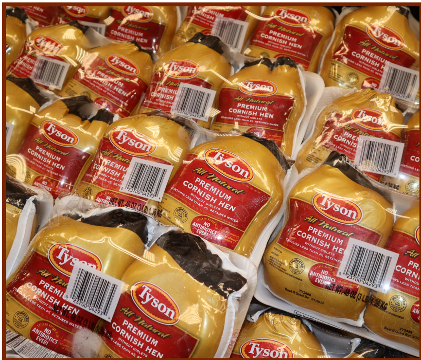
Photo of Tyson products

Under the settlement, USPS will have to meet with the NAACP in the months before each national primary and general election through 2028 and to provide reports on service performance during the six weeks leading up to general elections. USPS will also issue guidance documents to address its plans for prioritizing the monitoring and timely delivery of election mail for the national general elections through 2028. These measures will be similar to the measures used in the weeks leading up to the 2020 general election. Those measures, which the court required USPS to implement in response to our motions, helped to ensure that the vast majority of mailed ballots were delivered to the boards of elections in time to be counted.