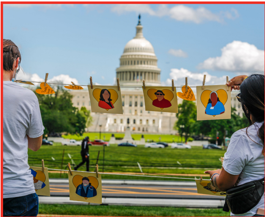
Supporters hang signs commemorating family and friends who have died of COVID-19 at the Rally for Vaccine Access for Everyone, Everywhere on May 5 in Washington, D.C.