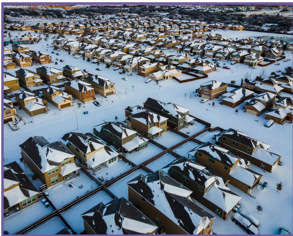
Photo of Austin, Texas, covered in snow during Winter Storm Uri courtesy of Shutterstock.

As we’ve said many times, wind and solar energy – a linchpin of the new Texas energy economy – should not be a partisan issue. A majority of Texas lawmakers, including some Republicans whose districts have benefited from thousands of new clean energy jobs, agreed in this case. They opposed efforts to lay the burden of these additional costs onto wind and solar power producers. ■