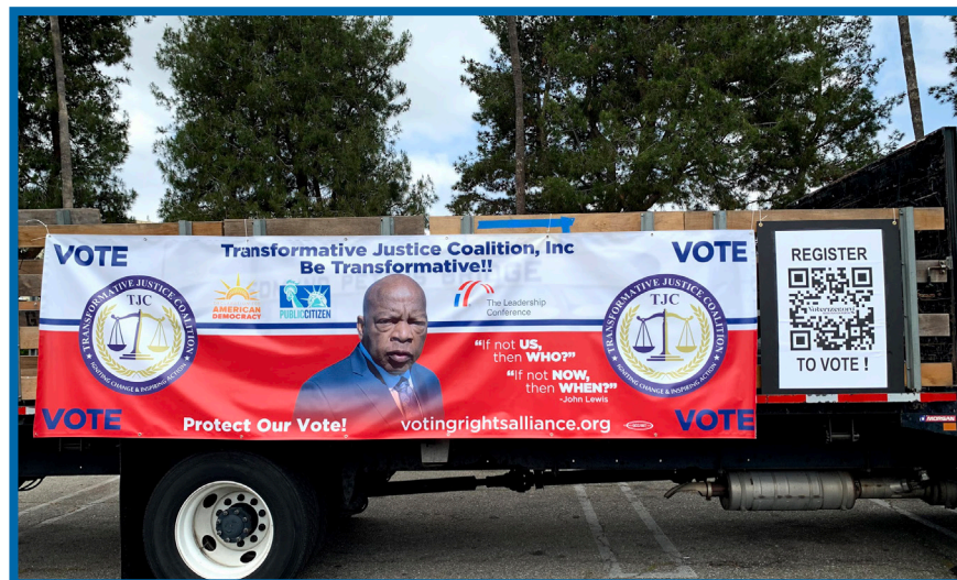
A voter education truck winds its way through Los Angeles, Calif., on the National John Lewis Voting Rights Advancement Action Day.