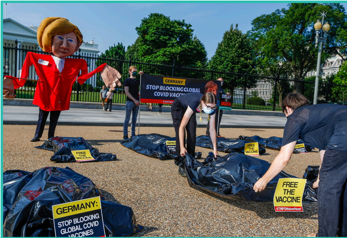
Protesters arranged body bags outside the White House during a protest on July 15 calling on German Chancellor Angela Merkel to stop blocking an emergency waiver of intellectual property rules needed to increase global production of COVID-19 vaccines.

The Global Trade Watch (GTW) division of Public Citizen spent most of 2021 fighting World Trade Organization (WTO) rules that artificially restrict the availability of vaccines and treatments around the world. GTW has been rallying support for an emergency COVID-19 waiver of WTO Trade-Related Aspects of Intellectual Property (TRIPS) rules that require countries to guarantee pharmaceutical firms monopoly control of how much medicine is made and where it is sold. The waiver would make clear that WTO rules do not stand in the way of governments and manufacturers worldwide ramping up production of the COVID-19 vaccines, treatments, and tests necessary stop the rise of variants like Omicron and finally end the coronavirus pandemic.