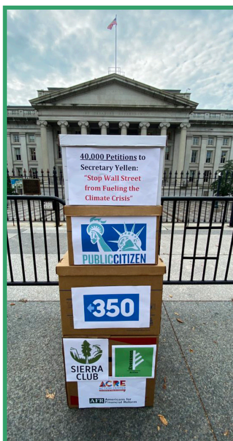
In October, Public Citizen and other groups delivered more than 40,000 petition signatures to U.S. Treasury Secretary Janet Yellen demanding climate action.

Along with partner organizations, we also influenced the creation and execution of the Executive Order on Climate Related Financial Risk, which President Joe Biden issued in May. The president directed the U.S. Department of the Treasury to issue a report on climate-related financial risk, which we worked to influence and strengthen. ■