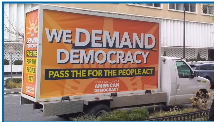
A mobile billboard circles the U.S. Capitol in Washington, D.C., during "Democracy Week" to underscore the importance of the For the People Act to ensure a robust democracy.

In 2022, we will celebrate Public Citizen's 50th anniversary. Even as we look back on the past fifty years of being on the frontlines of advancing consumer protection, health and safety, and justice and democracy rights, we are redoubling our efforts to move us closer to a nation of opportunity and justice for all. ■