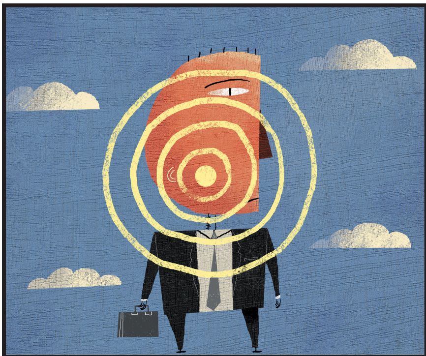
Graphic courtesy of James Yang.