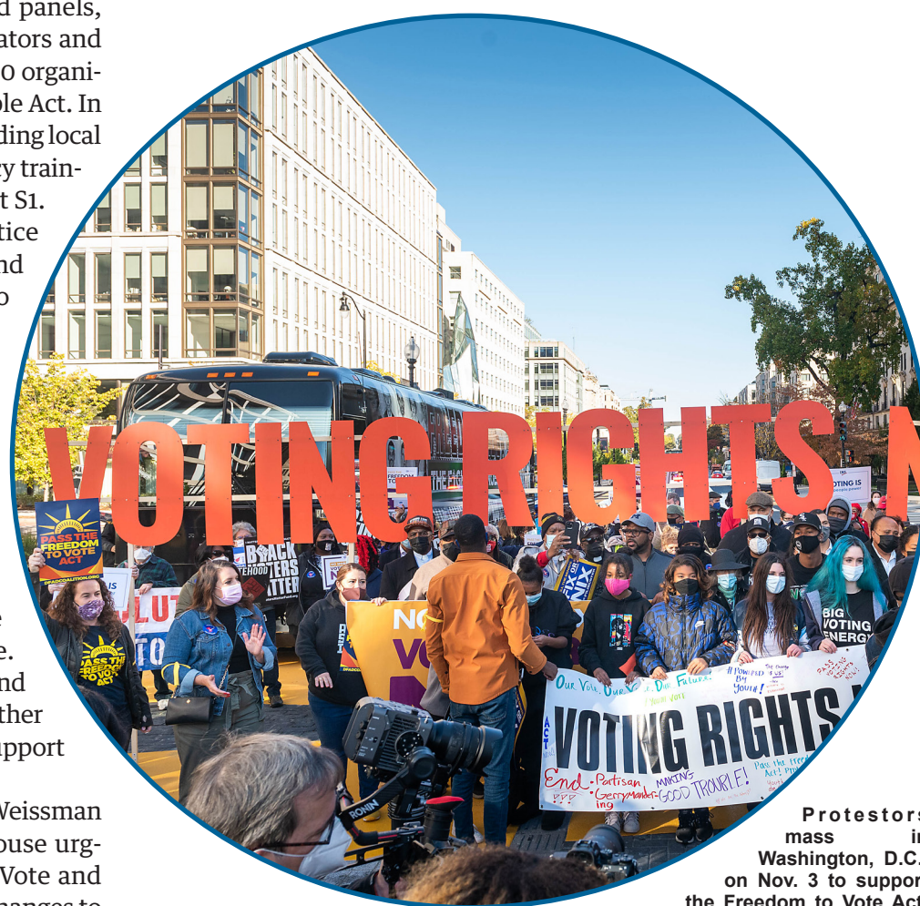
Protestors mass in Washington, D.C., on Nov. 3 to support the Freedom to Vote Act.

In 2022, we will continue to defend democracy from rising authoritarian movements and, simultaneously, work for the transformative democracy reforms our nation needs to deliver on its best ideals. ■